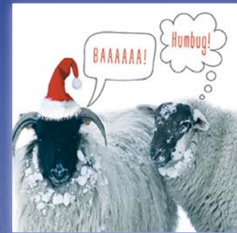
5. BAAAA HUMBUG