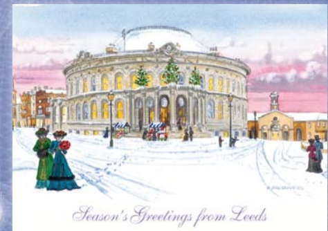
13. CORN EXCHANGE LEEDS